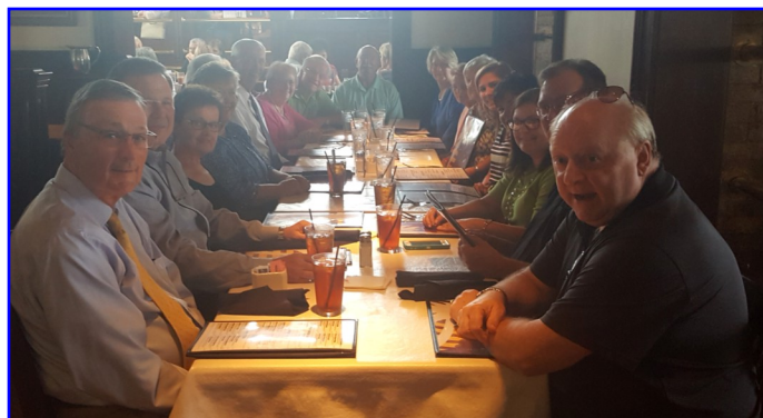
Razberries enjoy Sunday lunch at California Dreaming