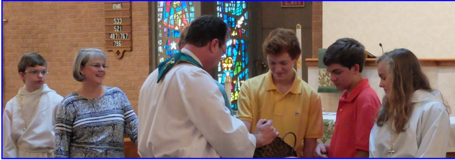
Blessing of the Back Packs