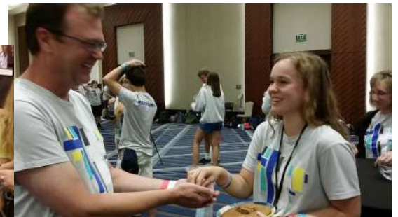
ELCA Youth Gathering in Houston, Texas