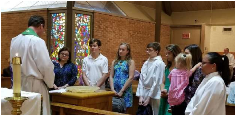
Blessing of Bookbags, and the students, teachers, and administrators who carry them.