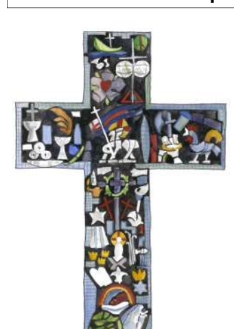
living in the light of our Saviour

NON-PROFIT ORG. U. S. POSTAGE P-A-I-D COLUMBIA, SC 29292 PERMIT NO. 160