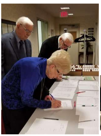
OSLC Stewardship Sunday

Elderberries enjoyed a Thanksgiving meal at Transfiguration