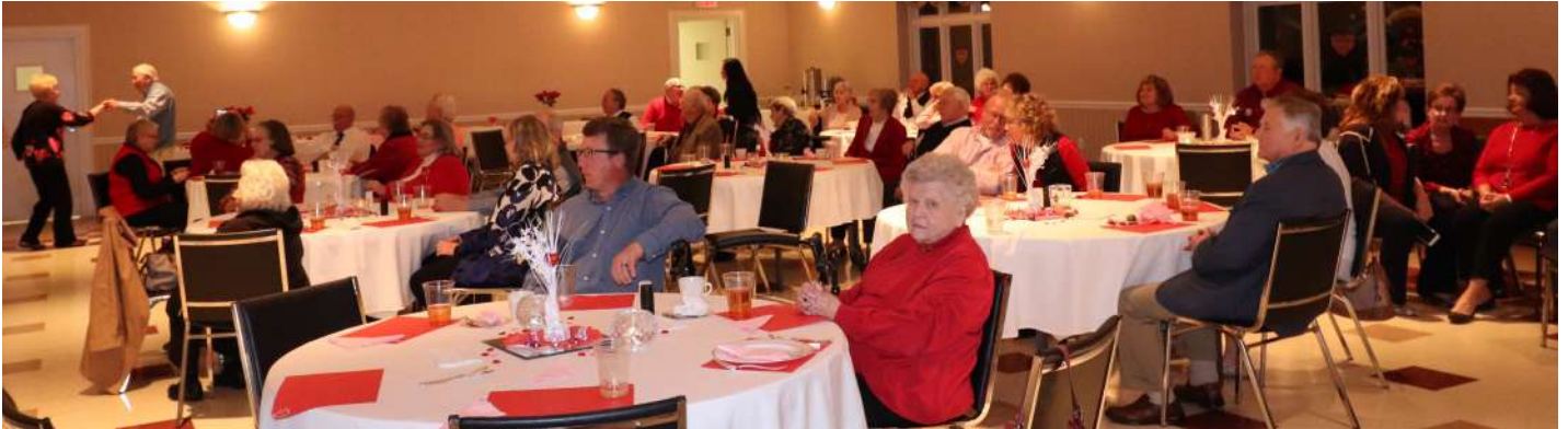
Above and left: Celebrating love at the WELCA Valentines Day Party hosted by the Rebekah Circle