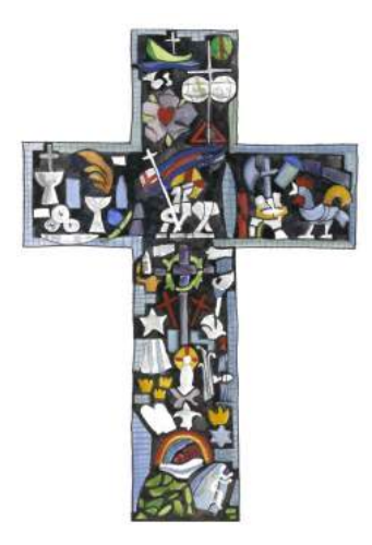
living in the light of our Saviour

The Worship and Music Committee would like to request your assistance this year by asking you to lend a poinsettia for our Christmas Services at a cost of $13.00 includes tax). Your check should be made payable to the church and marked for POINSETTIA. Please indicate in the space below the information you would want printed in the Christmas bulletin. Please place in offering plate or mail to the church with your check BEFORE Sunday, NOVEMBER 10.