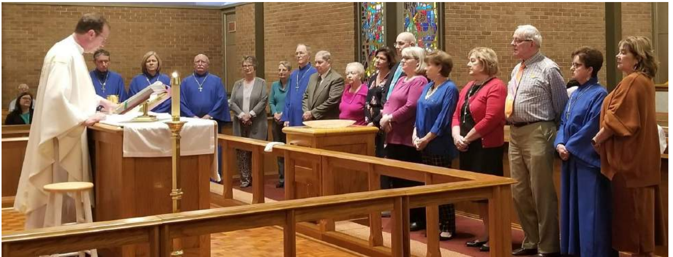
Installation of 2020 Council, WELCA, and Lutheran Men leaders