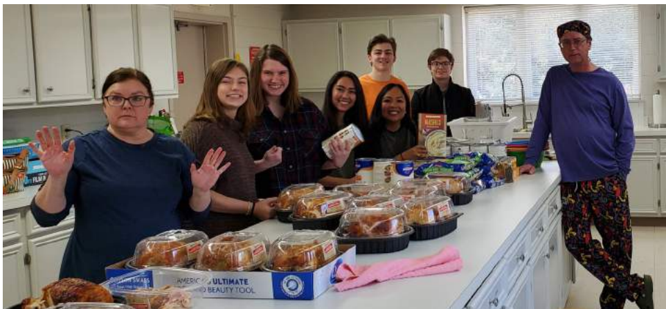
February 2nd is Souper Bowl Sunday at OSLC. Quarts and pints of soup will on sale after church in the Fellowship Hall. All proceeds goes to God's Helping Hands.