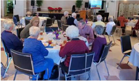
Elderberries January Meeting