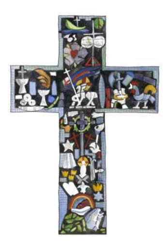
living in the light of our Saviour

NON-PROFIT ORG. U. S. POSTAGE P-A-I-D COLUMBIA, SC 29292 PERMIT NO. 160