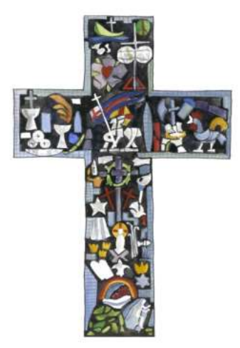
living in the light of our Saviour