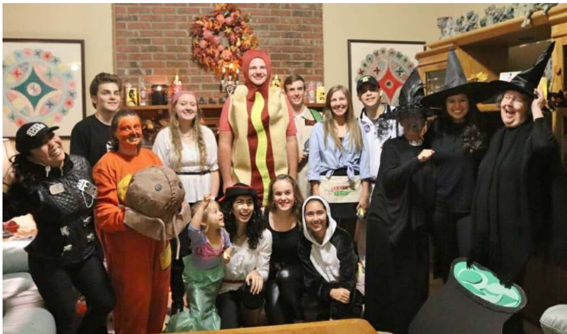
Handbell Choir's Halloween Party