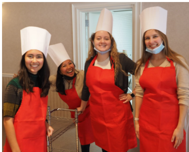
"Servers" at the Congregational Dinner

A meeting for all WELCA members will be held immediately following Worship today in the Fellowship Hall. We need to approve the election of officers and the 2022 Budget.