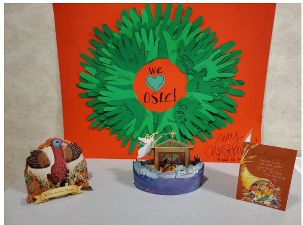
Cards from Classical Conversations .

John was born into a poor family with roots in nobility. He joined a Carmelite monastery and became a priest in 1567. Because he favored stricter adherence to the rules of the order, John urged reform similar to that being undertaken with the women of the order by Teresa of Avila. His superiors had him imprisoned, but he escaped. John is remembered as a founder of the reformed Carmelites and also as a poet and Christian mystic.