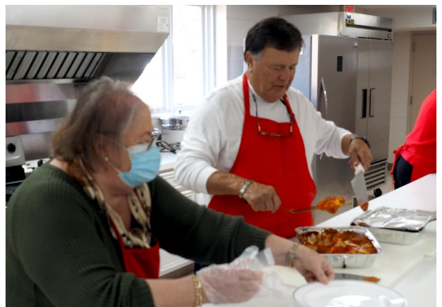
Pictures from Congregational Luncheon after Annual Congregational Meeting