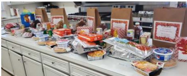
Food in Abundance! Thanksgiving Meals for Families at SRAA