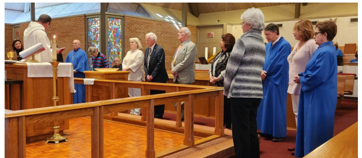
Installation of Church Council, WELCA, and LMM Officers.