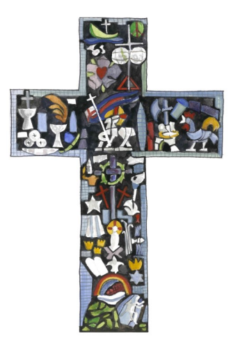
living in the light of our Saviour