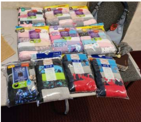
Elderberry Project for SRAA