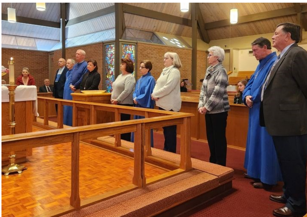
Installation of 2024 Officers