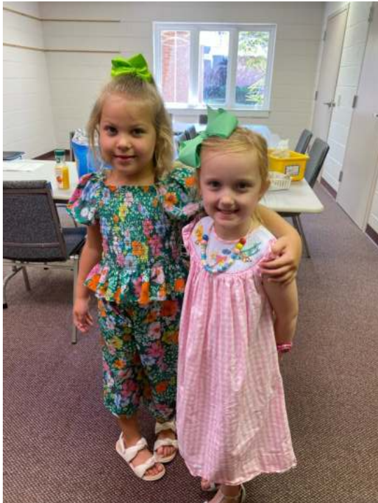
Youth Sunday School on the First and Third Sundays!