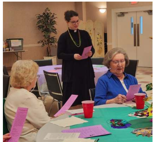
Shrove Tuesday Event