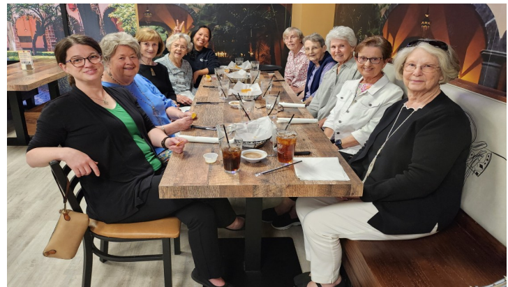
Cameron/Rebekah Circle Luncheon Outing in May