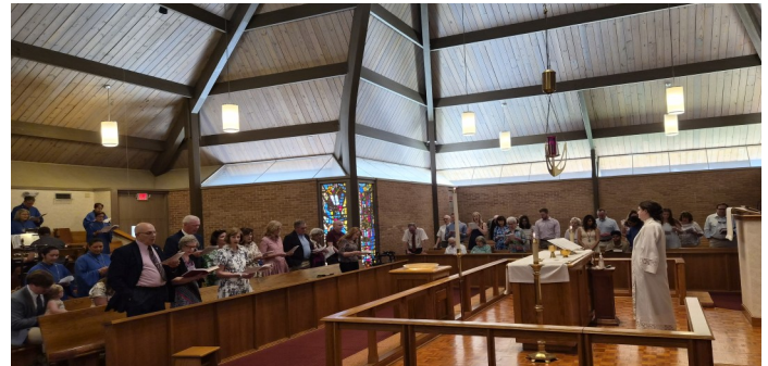
OSLC Sanctuary on Mother's Day