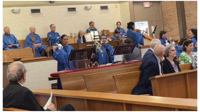
Choir and Handbell Choir on Mother's Day

Despite his stature as an important second-century theologian, Irenaeus' personal biography is a virtual blank. He was probably born in Smyrna and educated in Rome. Later, he was appointed bishop at Lyons in Gaul (now France). Irenaeus opposed Gnosticism's emphasis on closely-held knowledge, affirming instead that the truth handed down from the Apostles is for all people in a church that is catholic in its scope and not defined by national boundaries.