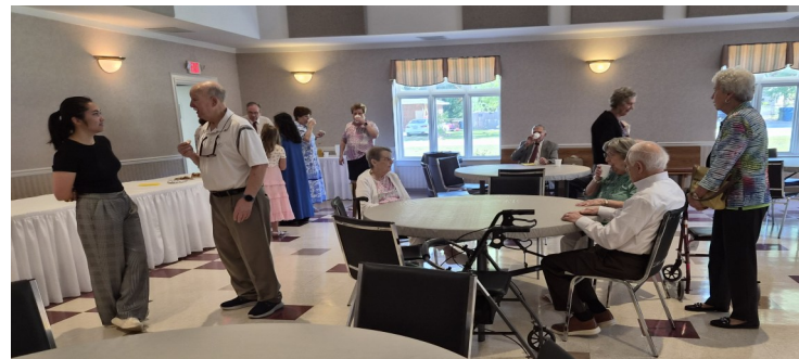
Chat & Snack is back on the 2 nd Sunday of the month.